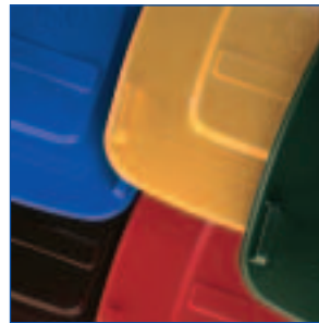
Variety of colours