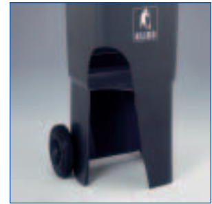
MGB 60 l section