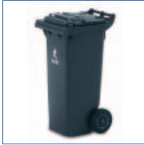
MGB 80 l