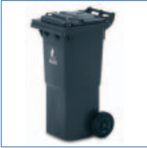
MGB 60 l

plastic can then be used in the production of many different products. They are equipped with rubber tired wheels with a solid axle made from galvanized, tempered steel. The MGB 60 l and 80 l are resistant to frost, heat and chemicals and the smooth surface prevents waste from sticking.